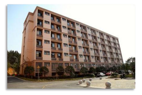
Xiaoheshan campus dormitory